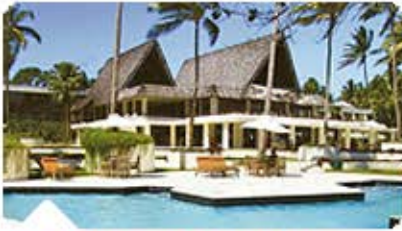
THE PEARL SOUTH PACIFIC - GARDEN (8891)

Spend your last day of your holiday enjoying the RCI resort you've booked into! Here are some RCI resorts you can enjoy in Fiji!