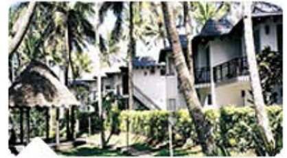
FIJI PALMS (0676)