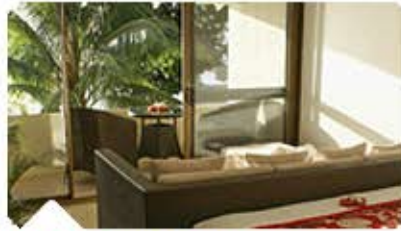
GARDEN ISLAND RESORT - SNT (RE79)