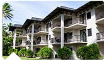
ULTIQA @ FIJI PALMS (7580)