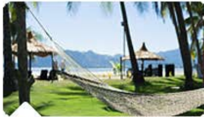
CLUB FIJI (RE75)